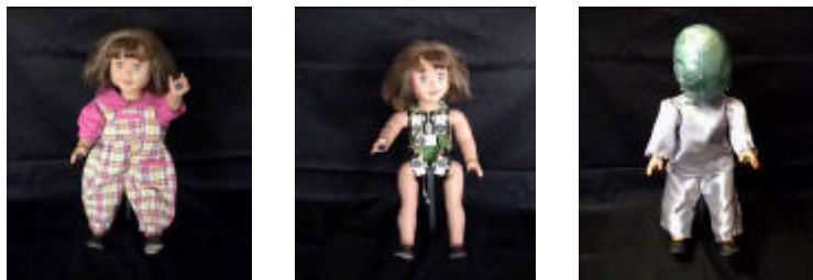
Figure #.1. The robot in its two different appearances (the centre figure shows the 'undressed' version revealing the robotic parts that control its movement)

Robota is connected through a serial link to a PC and can use speech synthesis, speech processing and video processing of data from a quick-cam camera. Using its motion tracking system, Robota can copy upward movements of the user's arms, and sideways movements of the user's head when the user sits very still and close to the robot, looking straight at it, engaging in turn-taking and imitation games with the robot. Machine learning algorithms allow Robota to be taught e.g. a sequence of actions as well as a vocabulary.