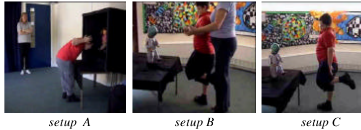
Figure #.2. The three phases of the trials

these occasions the robot was operated as a puppet by the investigator again. The investigator was able to recognise even subtle expressions of the child and to quickly respond to the child's movements, and also to introduce further complexity of turn-taking and role-switch into the simple imitation game.